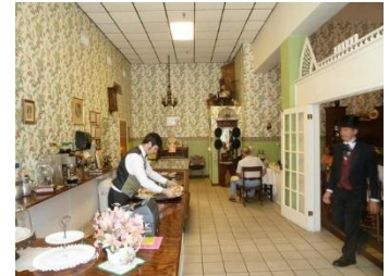
Mary Margaret's Restaurant

After the ceremony, we enjoyed lunch at the quaint, Victorian-styled restaurant, Mary Margaret's Tea and Biscuits, in downtown Arcadia