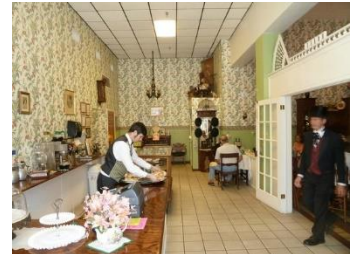
Mary Margaret's Restaurant

After the ceremony, we enjoyed lunch at the quaint, Victorian-styled restaurant, Mary Margaret's Tea and Biscuits, in downtown Arcadia