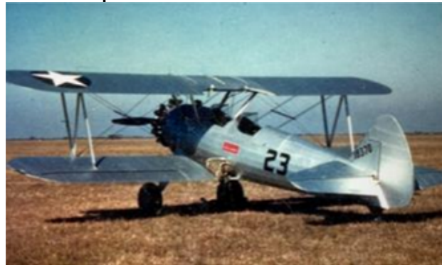
PT-17A No 23. 5BFTS, Clewiston, Florida 1942 http://www.vickersvaliant.com/no.5-bfts-clewiston--florida.html