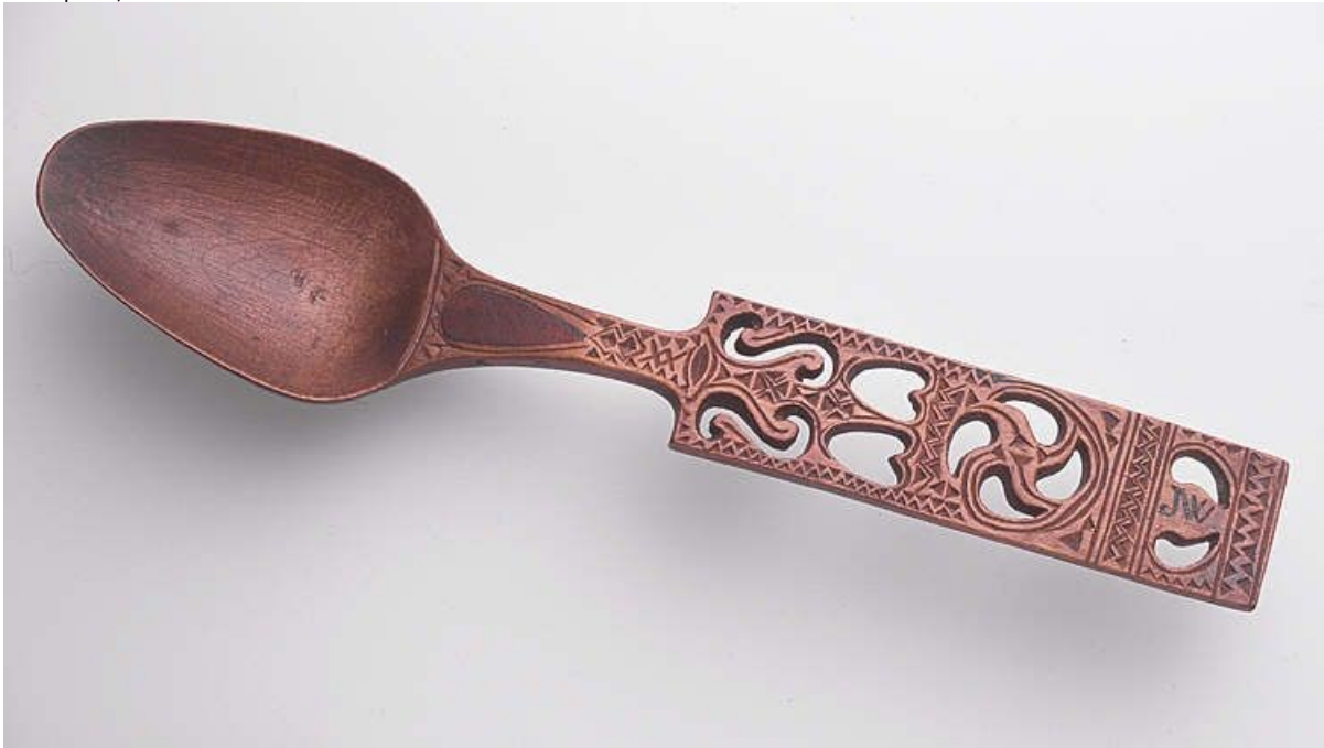
Lovespoon, with hearts and other geometrical designs