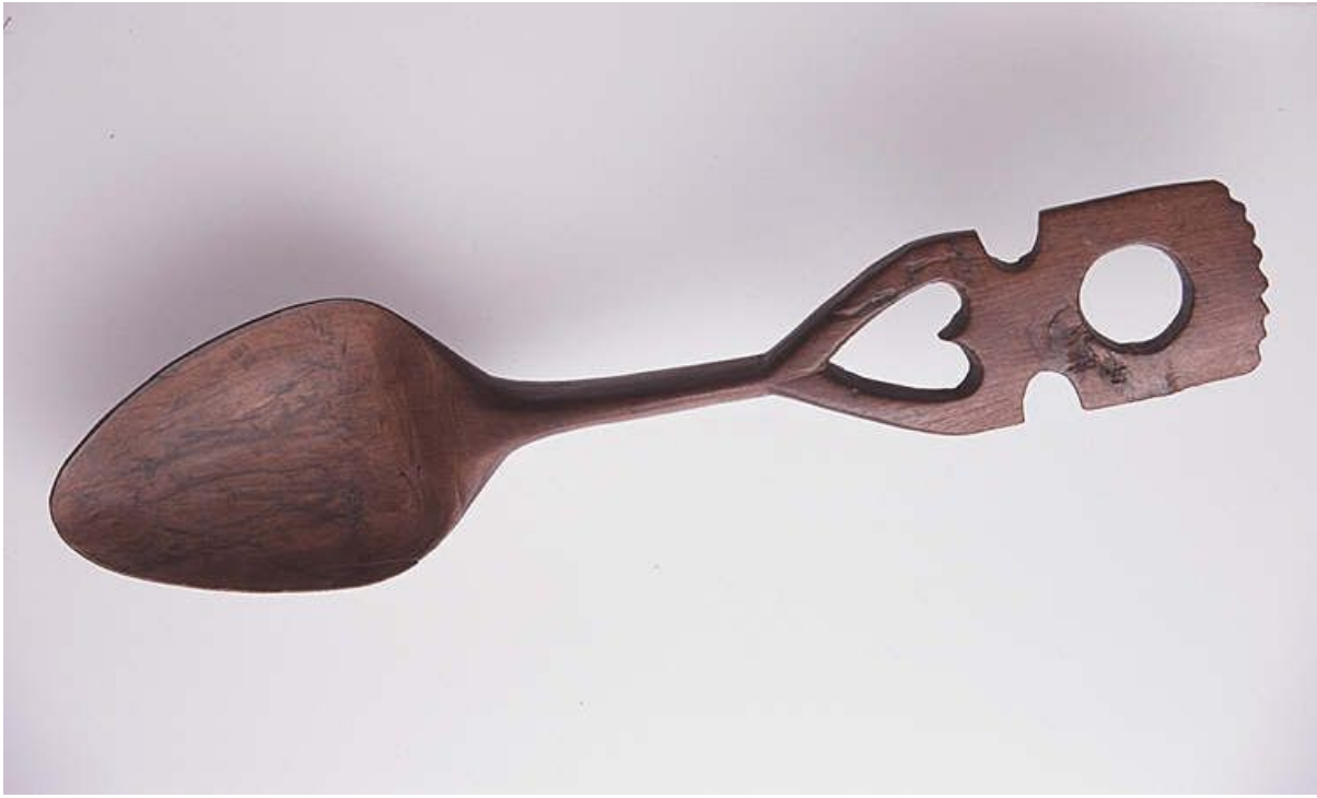
Lovespoon, with heart-shaped opening on handle