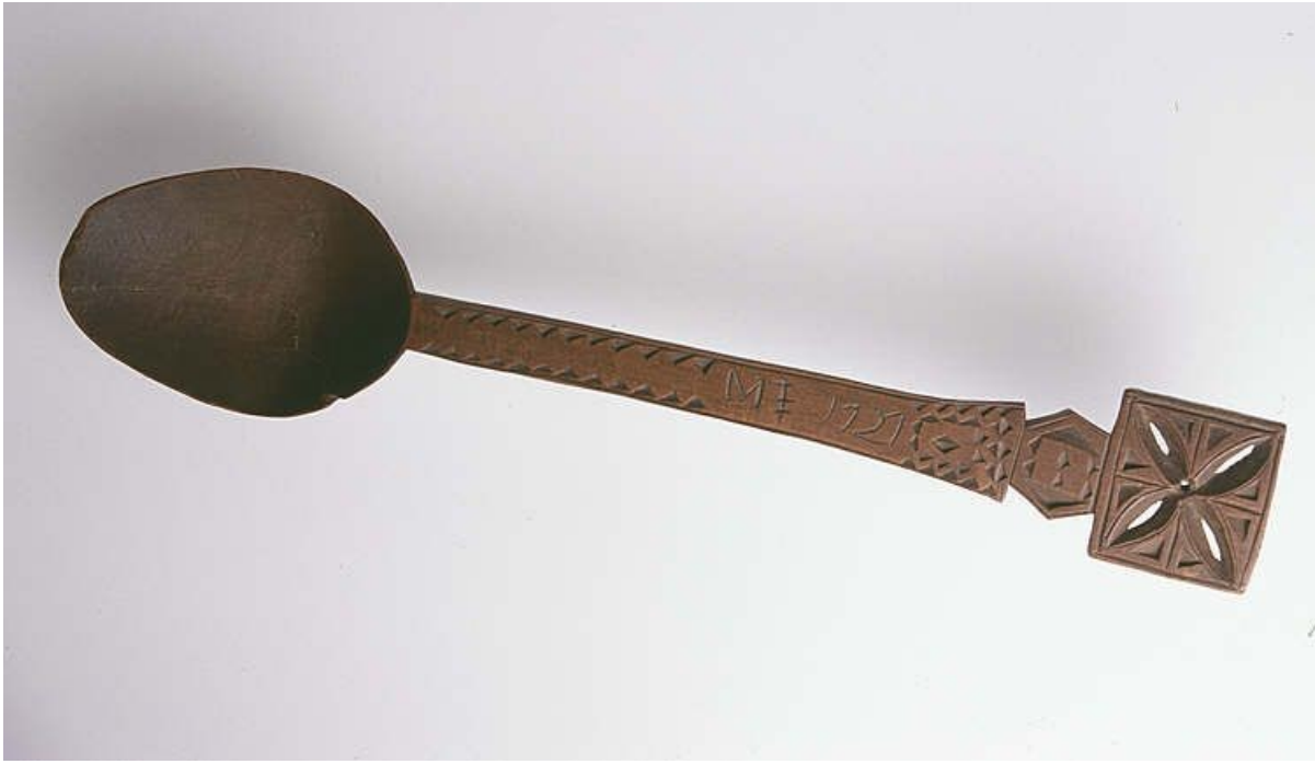
Lovespoon, inscribed 'MI 1721'