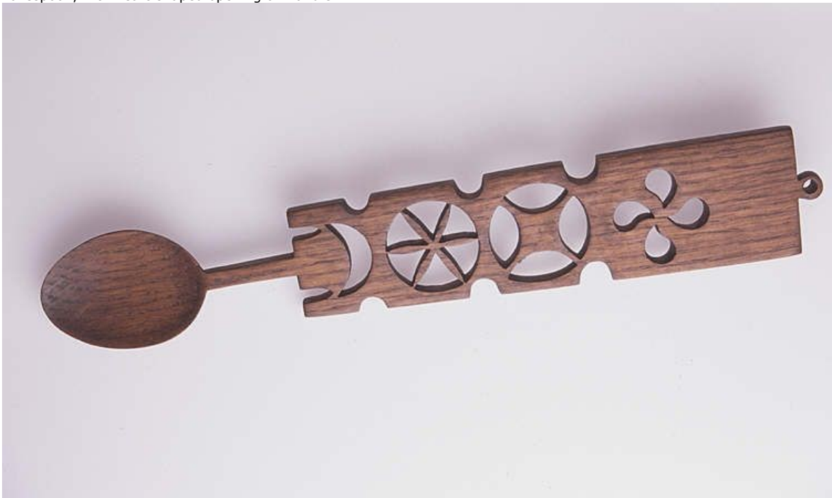
Lovespoon, with panel handle and geometrical designs