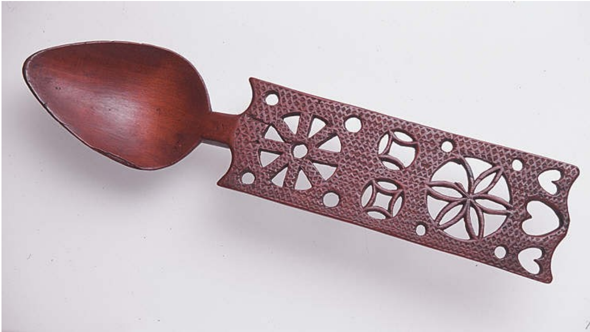
Lovespoon, with panel handle and covered with chip-carving

MABINOGIION: Possibly the most important record of early myth, legend, folklore and language of Wales is contained within The Mabinogion . The Mabinogion is a collection of eleven stories translated from medieval Welsh manuscripts including tales of pre-Christian Celtic mythology and traditions. Although translated from medieval text, the tales record characters and events from several centuries earlier, including mention of a revolting Roman Emperor and even reference to the Arthurian legend.