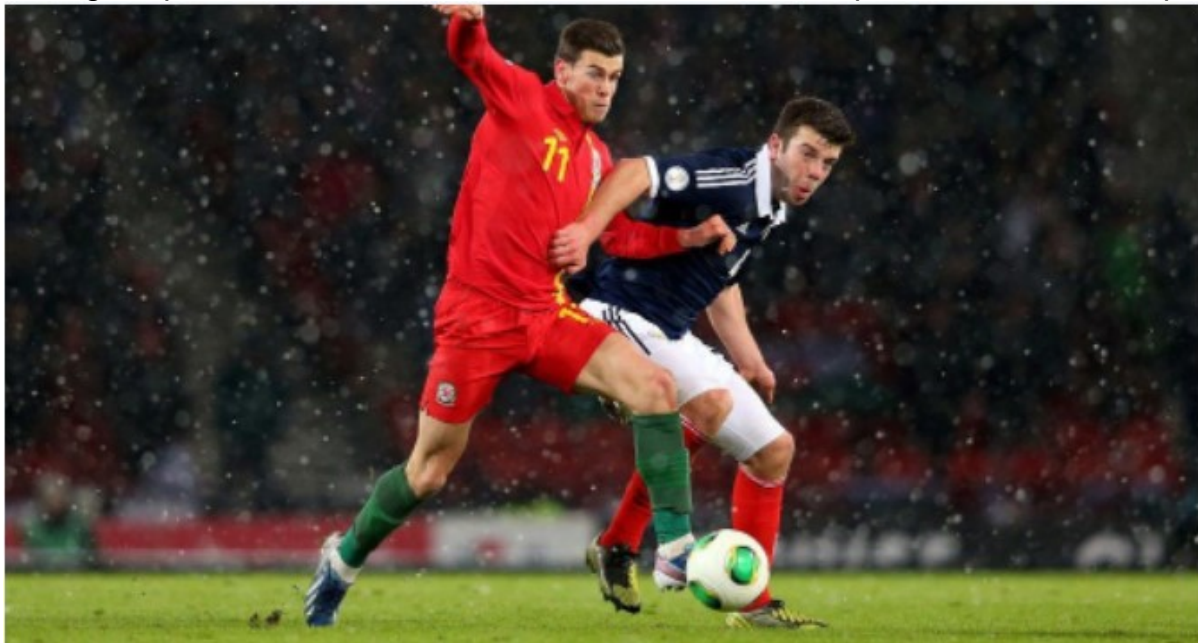
"Image caption, Gareth Bale and Wales face Ukraine for a place at the World Cup"